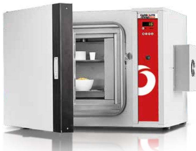
LHT 6/30 with 301 controller option